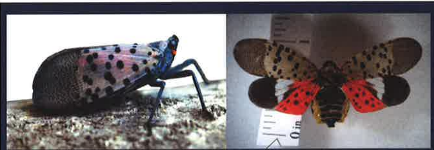
Adult Spotted Lanternfly, present in autumn months.

If you find any of these life stages of the Spotted Lanternfly, remove, devitalize, place in a sealed bag, and dispose of bag in the garbage.